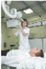
X-ray machine, X-ray computed tomography